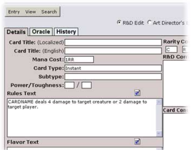
The Multiverse database: Where cards are born.

Because design names are done quickly, my names tend to fall into one of a few categories. (Note: these are my naming conventions; each designer has his or her own.)